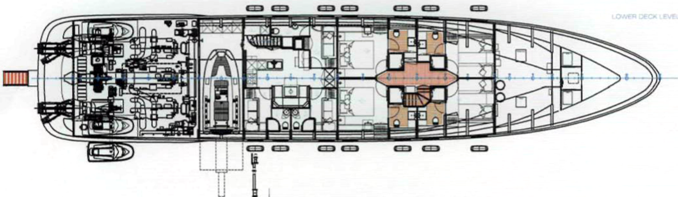
LOWER DECK LEVEL